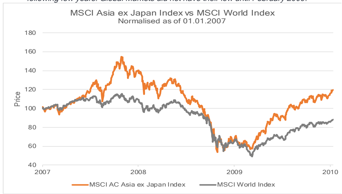
Chart showing 2008 period: Asia bottomed in October 2018 and outperformed for the following few years: Global Markets did not have their low until February 2009.

Usually in financial markets and economies, the shorter the timeframe the easier it is to forecast, and the later years become far foggier. Today, arguably, it is the reverse.